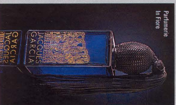
Parfumerie In Fiore